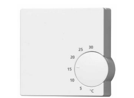
SALUS RT 10 Electronic room thermostat for radiant panel, radiator and convector heating systems